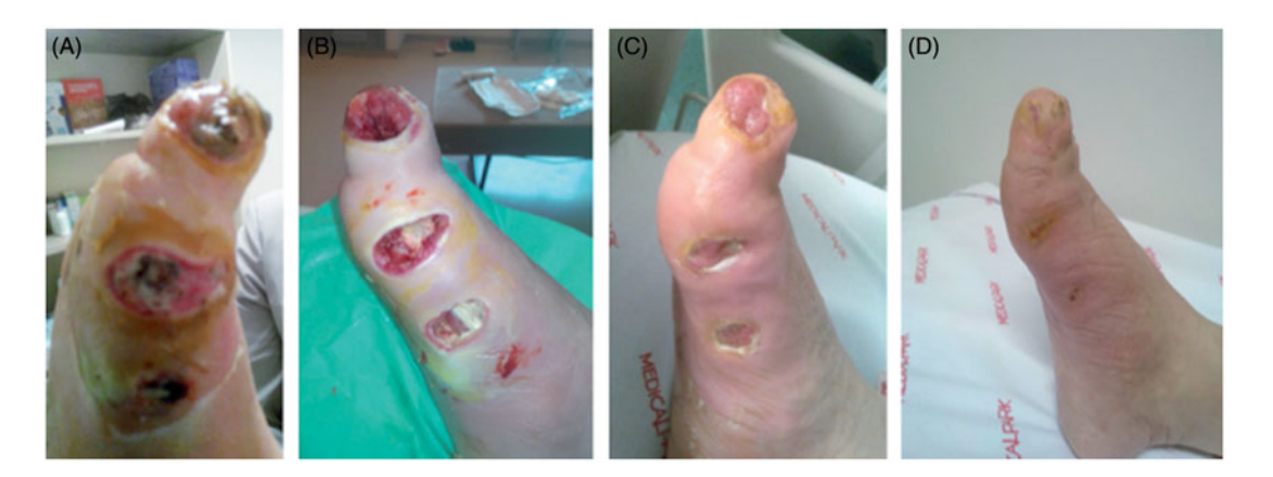
Figure 2. Extensive ischemic ulcer with osteomyelitis and infection. (A) Before treatment; (B) ulcer Immediately after debridement; (C) complete granulation at the end of the treatment; (D) complete re-epithelization after the follow-up.

The primary objective of treatment for DFU is to obtain complete wound closure as expeditiously as possible. Therapy with a growth factor should be maintained until this goal achieved. In this sense, this study shows that the continuity of the treatment with intralesional Heberprot-P up to complete wound closure is feasible and safe to promote healing of chronic DFU. Treatment was well tolerated, adverse events were easily manageable and no significant safety concern was reported. These results are better than those reported in